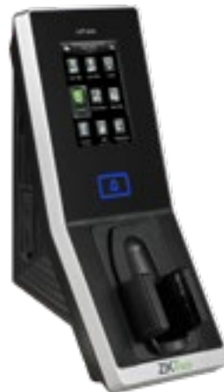
inPulse RFID + Vein