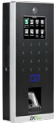
ProCapture-T RFID + Fingerprint