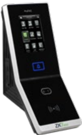
ProFAC RFID + Face