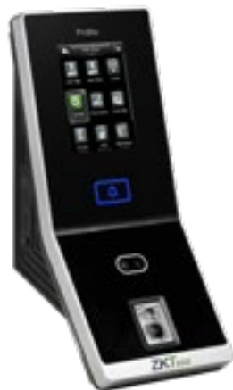
ProBio RFID + Face+ Fingerprint