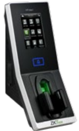
inPulse+ RFID + Vein + Fingerprint