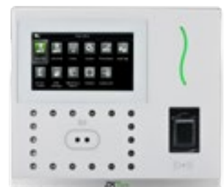
G3 Fingerprint + Face